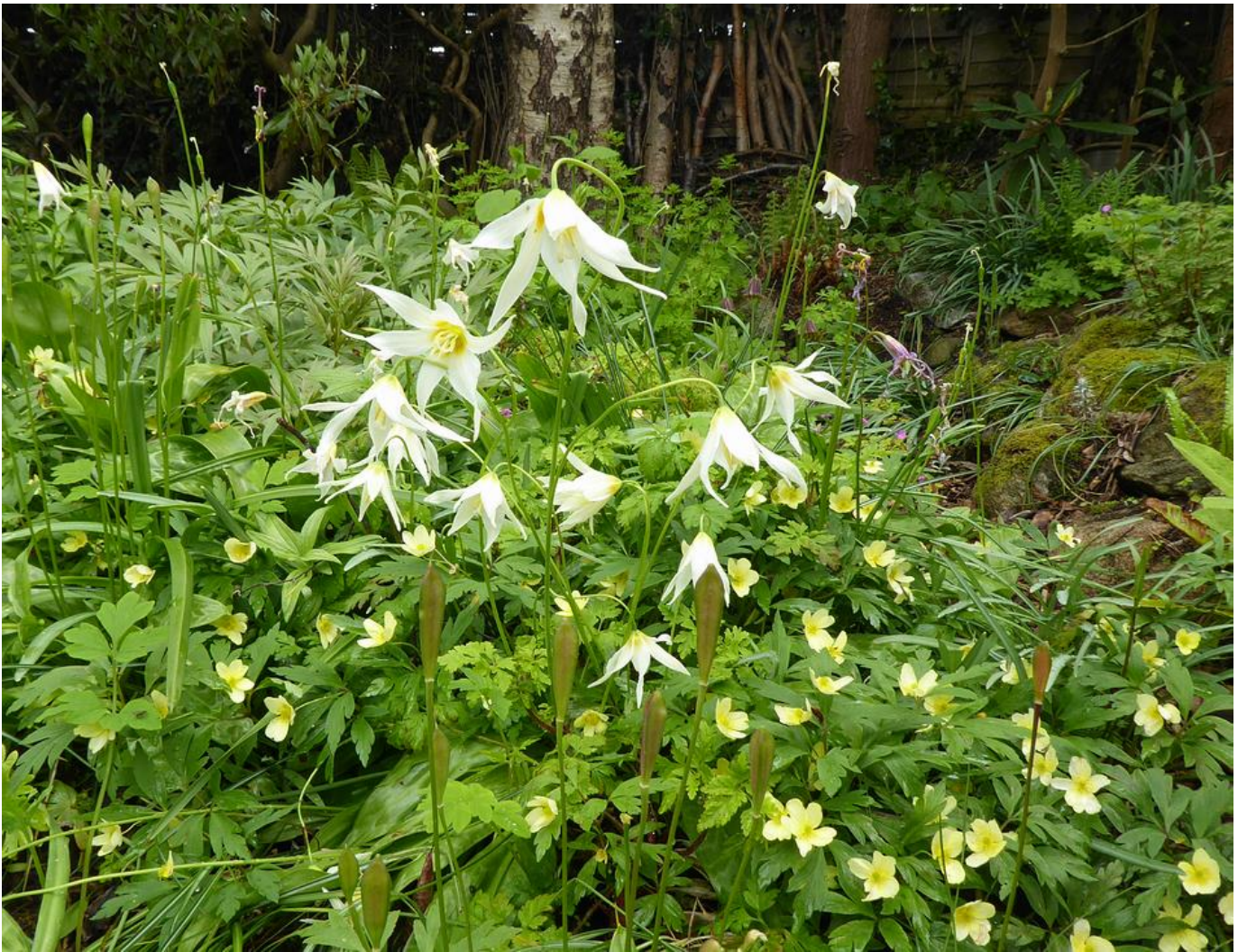
This form of Erythronium oregonum is always the last to flower.