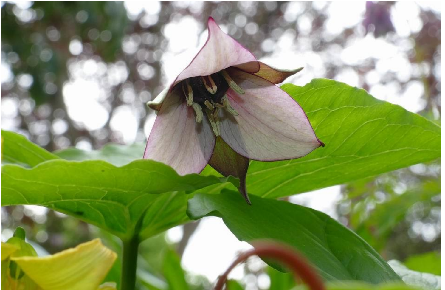
Trillium sulcatum hybrid