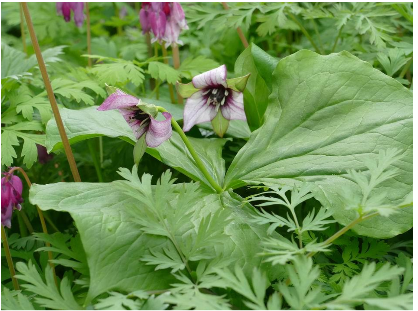
Trillium sulcatum hybrid