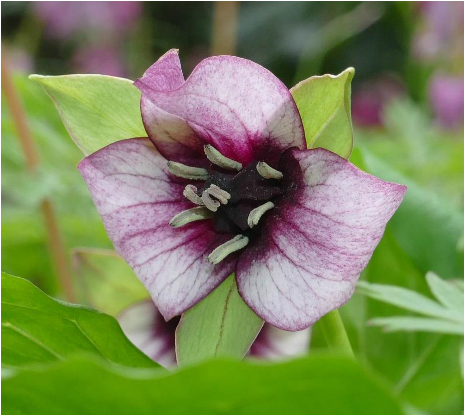
Trillium sulcatum hybrid